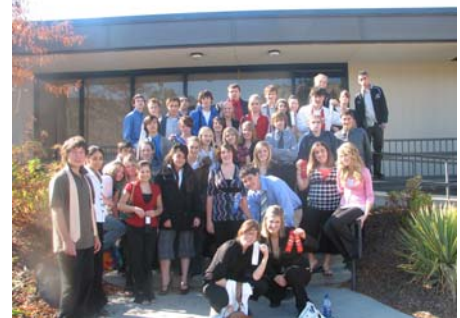
Klamath Union at the District III competition last year.

Don't miss your opportunity to be a part of this great competition!