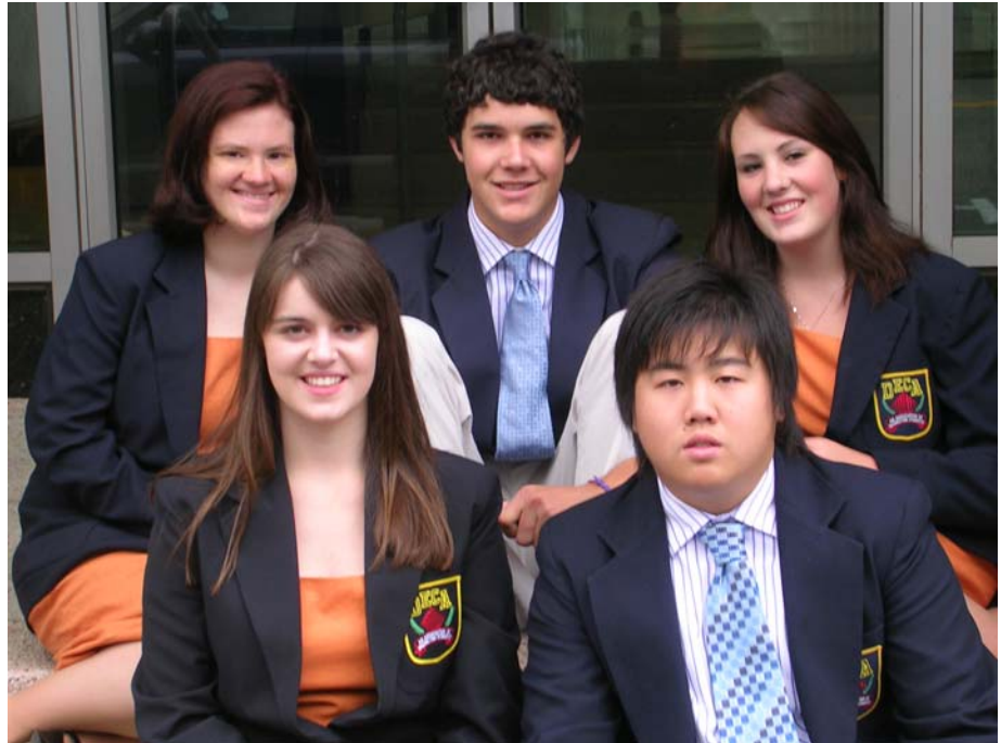
The state officer team at their August planning meeting.