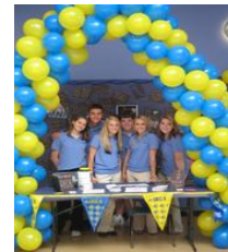
Lebanon DECA's booth during last year's DECA week.

The options for activities for DECA Week are endless. So dream big Oregon DECA and have fun! We wish you the best of luck.