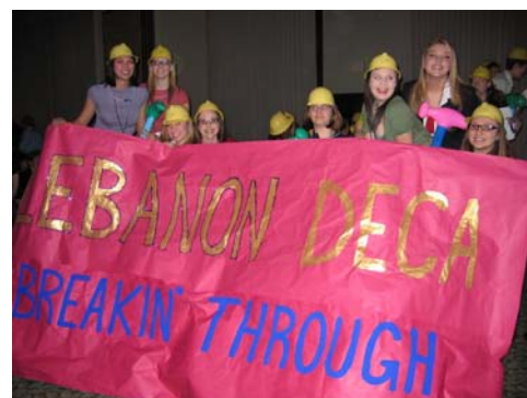
Lebanon DECA winning the enthusiasm award at SCDC 2008.