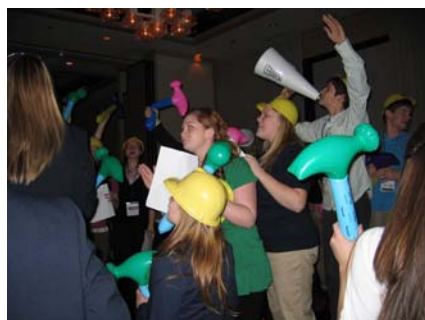
Lebanon DECA showing their enthusiasm at SCDC 2008.

brings, which is worth 10 possible points.