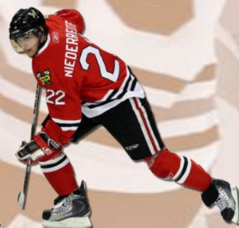
Nino Niederreiter 2010 World Jr. Hockey Championship All Star